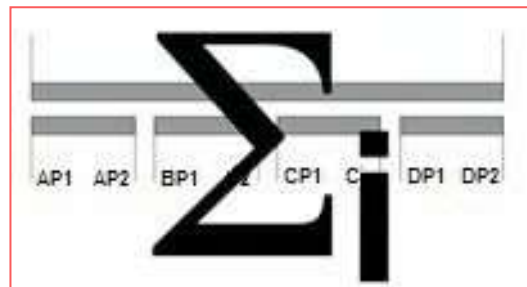
Summation Current Transformer