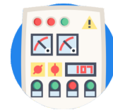
Marine & Shipboard Panels