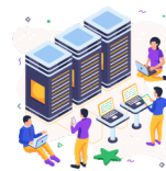
Telecom & Data Center Racks