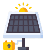
Solar Inverter Panels & Combiner Boxes