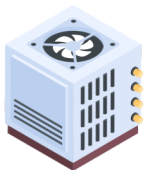
HVAC & Chiller Units